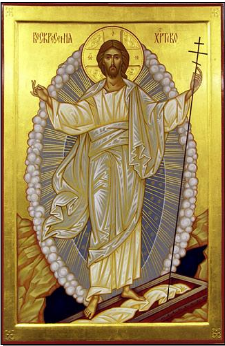
The Resurrection of Our Lord - April 24, PASCHA